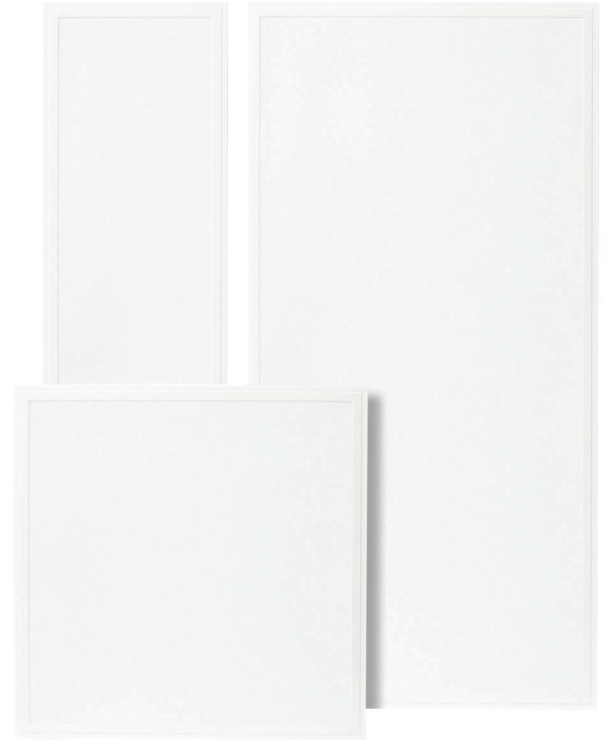
Surface Mount Kit