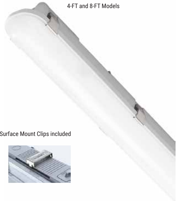
4-FT and 8-FT Models